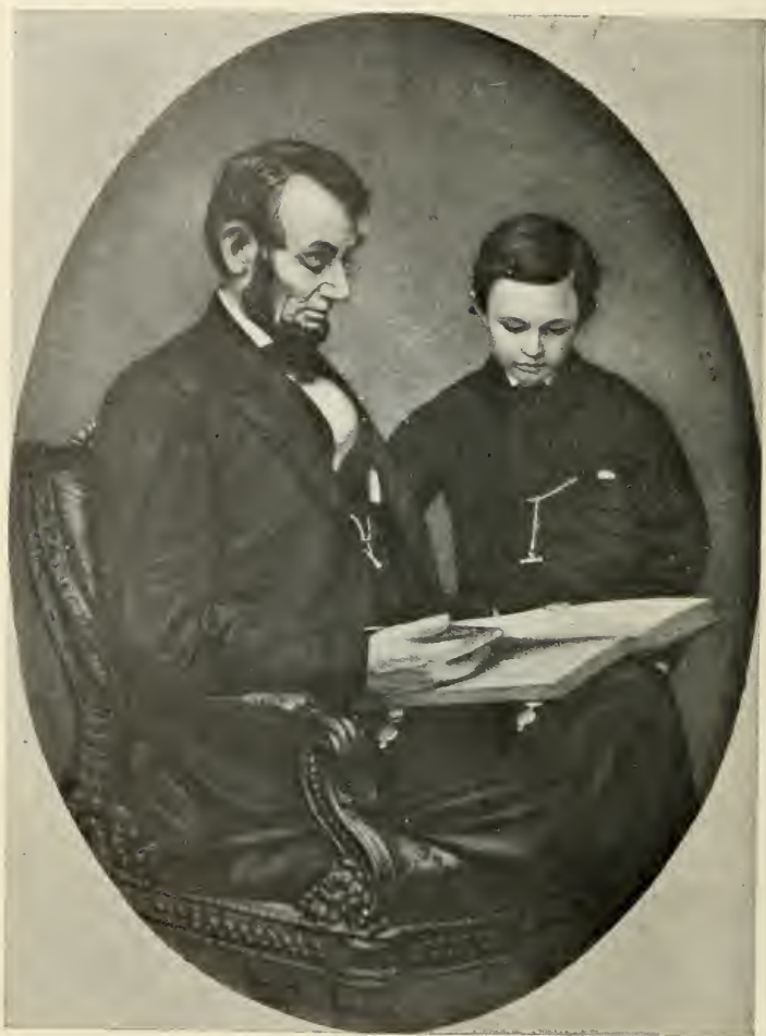
LINCOLN AND HIS SON "TAD"

From an Engraving after the Photograph by Brady